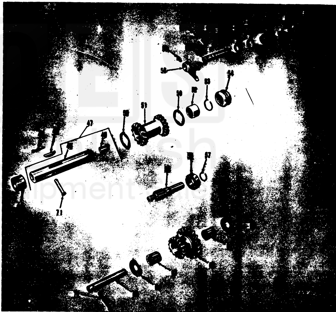
Figure 274. Transmission power takeoff assembly (3 of 3).